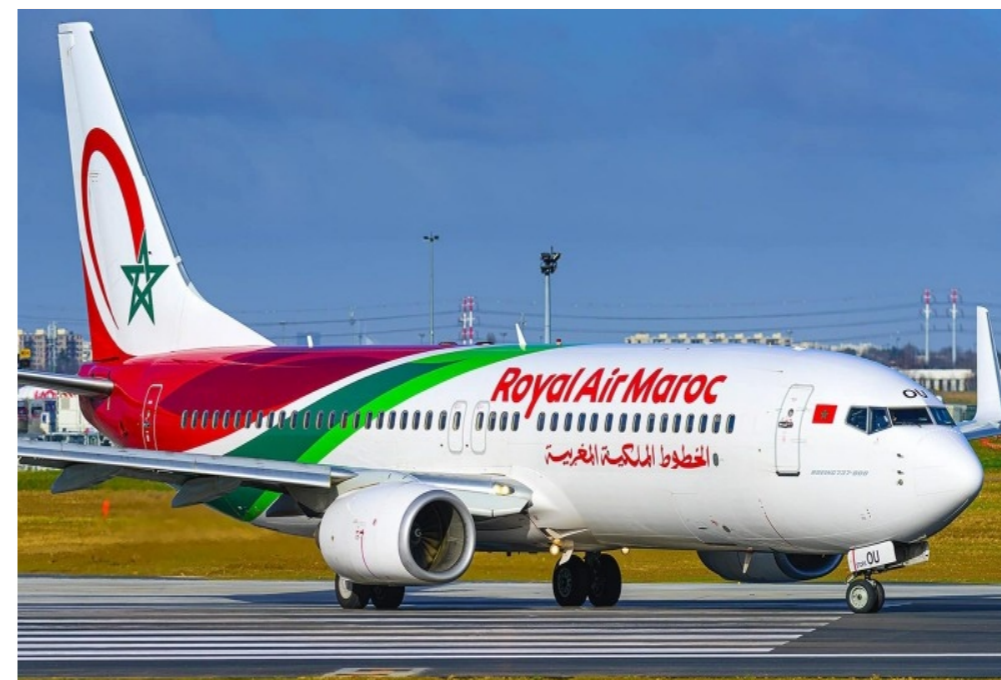
Royal Air Maroc Plane

Air for many reasons which include that a convergence at Lagos does not need any push, since it is already there. As the nation's commercial capital where