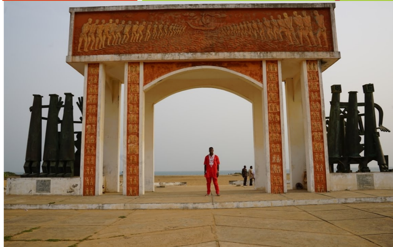
The Door of No Return in Ouidah, Benin Republic.

Zurab Pololikashvili, Secretary-General of UN Tourism, said: “As society progresses, the tourism sector, much like many other sectors, needs to transform to serve as a catalyst for prosperity at a universal scale. Enhancing the well-being of individuals, safeguarding the natural environment, stimulating economic advancement, and fostering international harmony are key goals that are the fundamental essence of UN Tourism. The organization takes on the role of driving a sustainable force that is now central to many economies.” Cont'd On Page 13