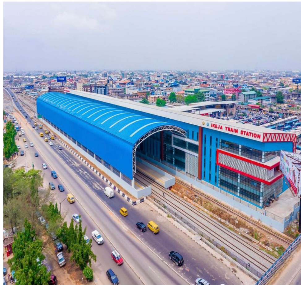
Ikeja Train Station

Kenya takes over the chairmanship for three years and will hold the position between 2024 and 2027.