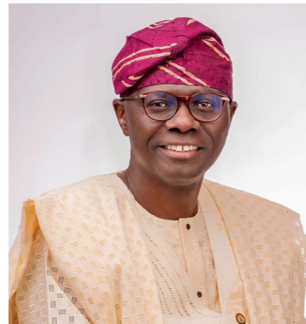
Babajide Olusola Sanwo-Olu, Lagos State Governor, Nigeria.