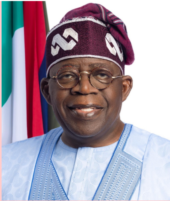
Bola Ahmed Tinubu, President of Nigeria