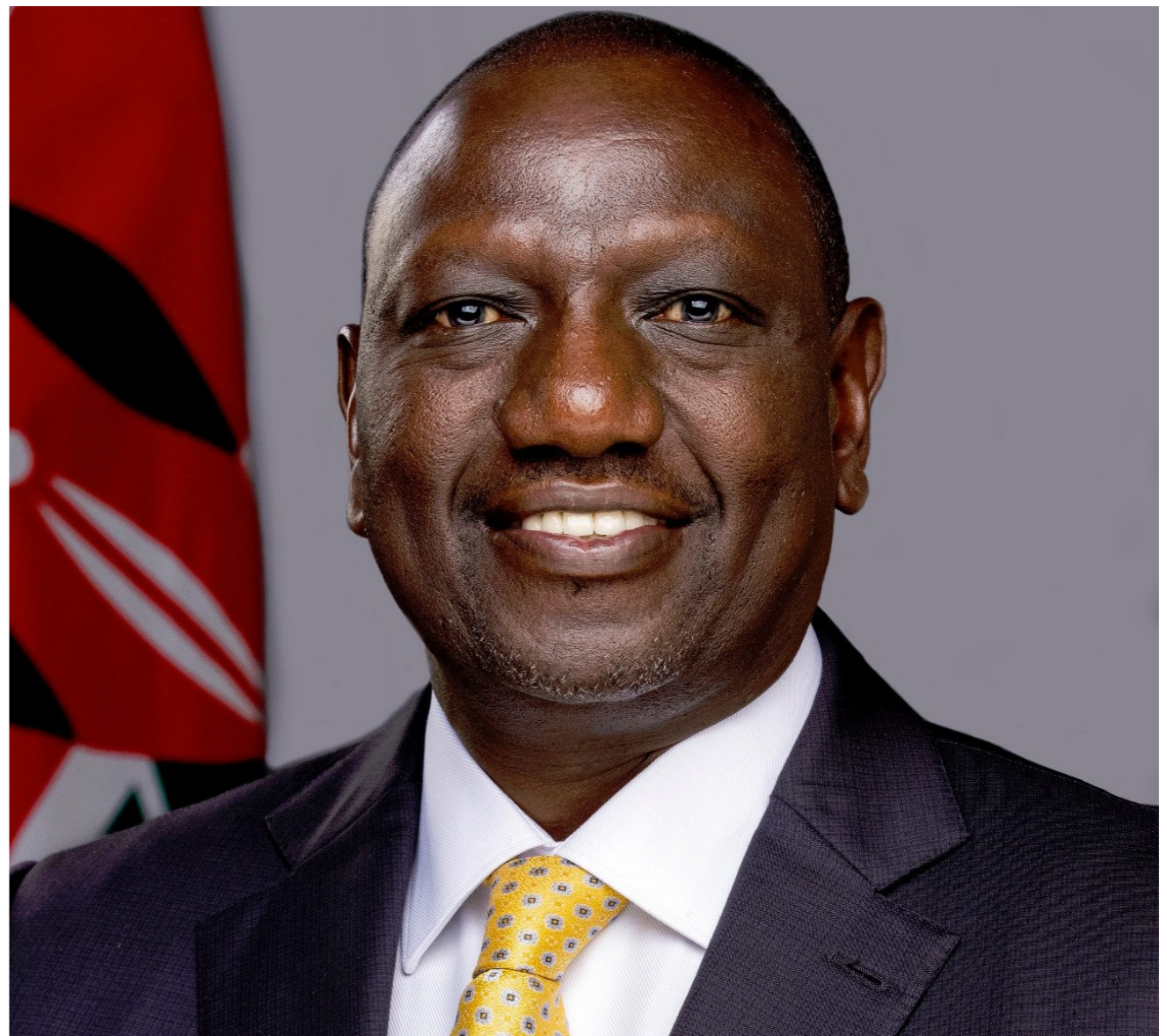
Dr William Samoei Ruto, Kenya President