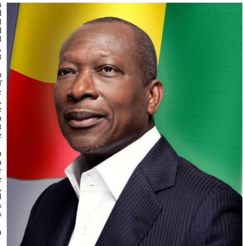
Patrice Talon, President of Benin Republic.

Ouidah's public squares hosted celebrations including jazz and dancing and even the president joined in.