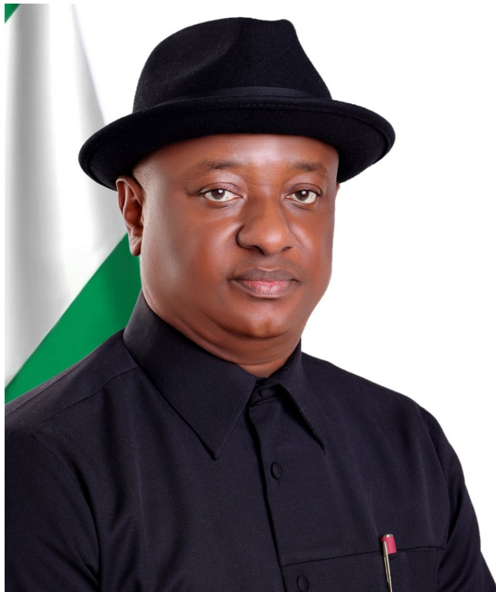
Festus Keyamo, Minister of Aviation and Aerospace Development, Nigeria