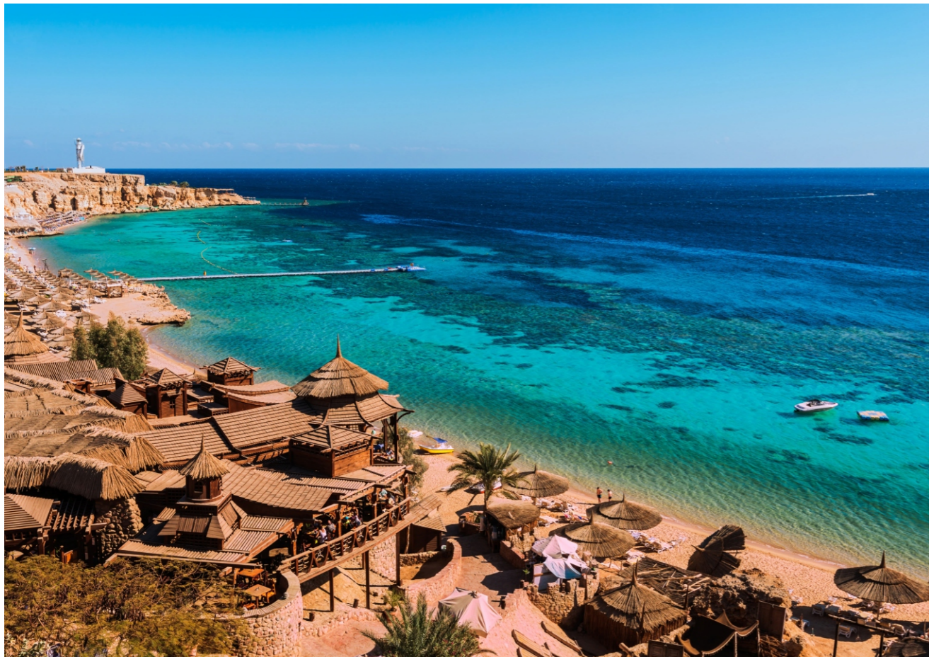
Sharm El-Sheikh, Egypt