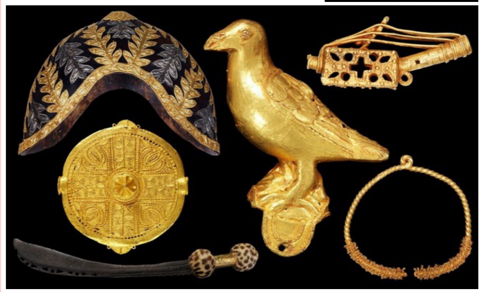
Looted Royal Artefacts, Ghana