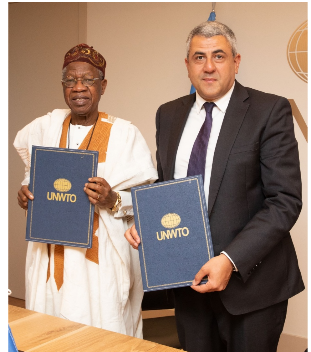
L: Lai Mohammed, Former Minister of Information and Culture, R: Zurab Pololikashvili, Secretary-General of UN Tourism

The new brand will be gradually implemented across all UN Tourism touchpoints over the next few months, beginning with digital channels such as the website, social media accounts and newsletters, followed by physical spaces such as offices and events, and elements such as reports and stationary. The origin of UNWTO stems back to 1925 when the first international congress of official tourist organisations was held at The Hague. The congress continued to meet annually, and in 1930, it decided to form a formal union, which in 1934 became the International Union of Official Tourist Publicity Organisations [IUOTPO]. Though, the history of organised tourism association did not start until 1925, when the International Corporation in tourism development had its beginning, and later when a conference took place in London in Oct, 1946 and in 1947 that IUOTO was founded.