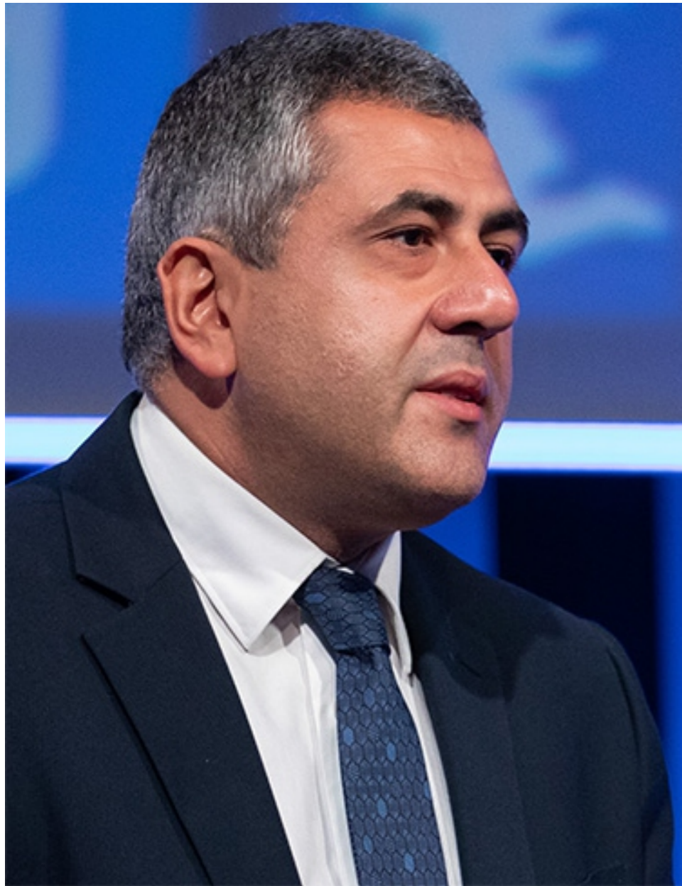
Zurab Pololikashvili, Secretary-General of UN Tourism