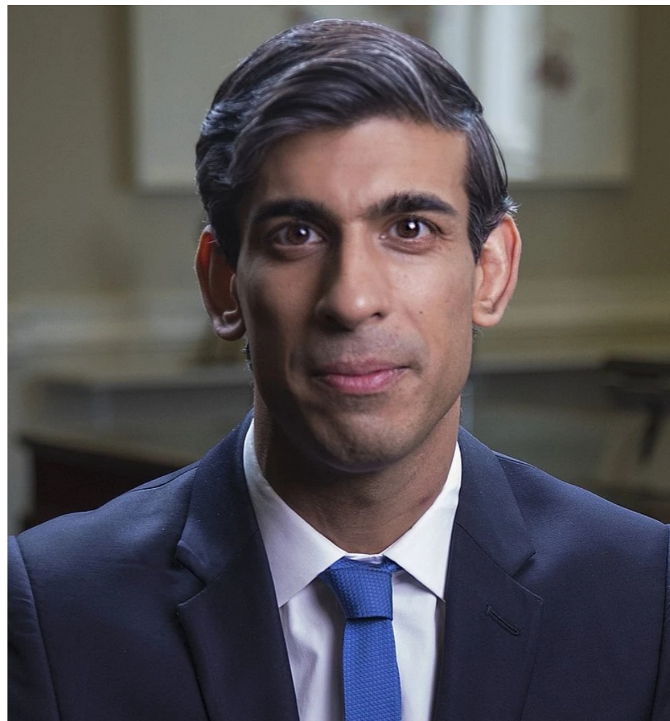
Rishi Sunak, British Prime Minister.